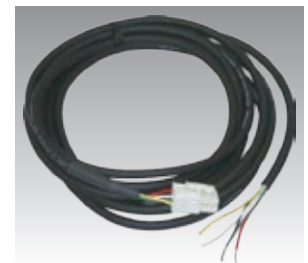
Power supply and signal extension cable