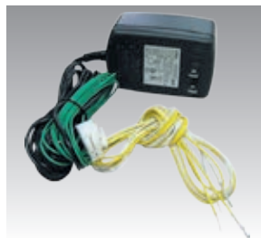
Custom AC adapter